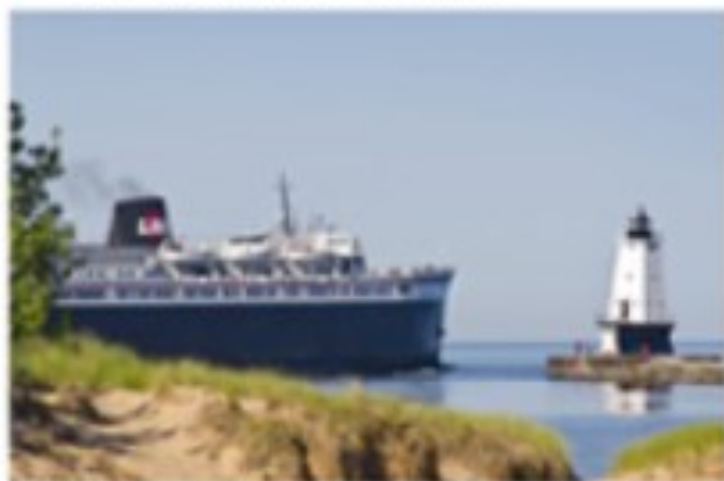
The S.S. Badger waiting to dock at Ludington, Michigan, passing the Ludington North Breakwater Light.

Ludington's North Breakwater Light has been ranked as the #1 lighthouse to visit in Michigan. This iconic lighthouse, located at the end of Ludington Avenue, is accessible from Stearns Park. It's a focal point within the community, and a great place to watch the sunset! Visitors and locals enjoy walking the long outer break wall (a mile-long round trip) leading out to the light. This location provides a close look at the S.S. Badger car ferry as it cruises from its home port to cross Lake Michigan, from Ludington to Manitowoc, and back. During open hours, visitors can climb the 53