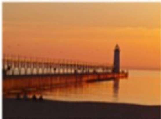
A view of the Manistee North Pierhead Lighthouse.

The most symbolic icon of the Victorian Port City is the North Pierhead Lighthouse , located between the 1st Street and 5th Avenue beaches of Manistee. Many Michigan lighthouses demolished their catwalks when the lights became electrified, so Manistee's catwalk is a rare sight. In the late 1920s, after extensive pier renovations, the old fog signal building was replaced by the present structure. Standing watch over Lake Michigan waters, Manistee's North Pierhead Lighthouse welcomes boaters into its harbor, and is a reminder of Manistee's great maritime history.