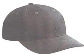
Hats w/ Logo $15.00 (Variety of colors)