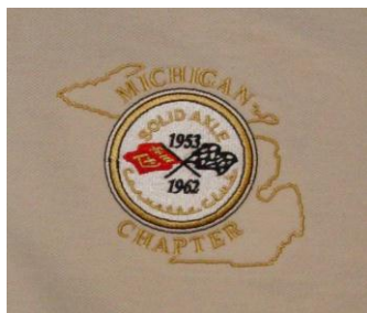
Men's and Ladies Shirt w/ Logo $30.00