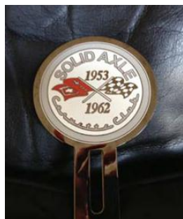
Auto Emblem 20.00 + $3.00 shipping