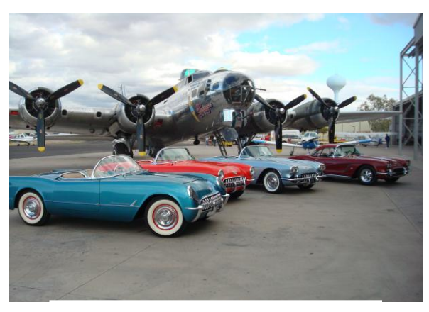
SACC National Jan 2012