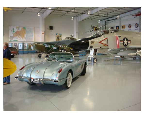
MI SACC National 2012