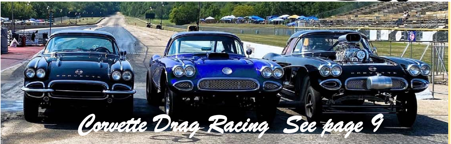
Corvette Drag Racing See page 9